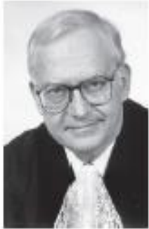
Professor, Judge Stephen M. Schwebel, former President of the International Court of Justice in the Hague:

"State [Israel] acting in lawful exercise of its right of self-defense may seize and occupy foreign territory as long as such seizure and occupation are necessary to its self-defense... Where the prior holder [Jordan] of territory had seized that territory unlawfully, the state which subsequently takes that territory in the lawful exercise of self-defense, [Israel] has, against that prior holder, better title... including the whole of Jerusalem, than do Jordan and Egypt. "